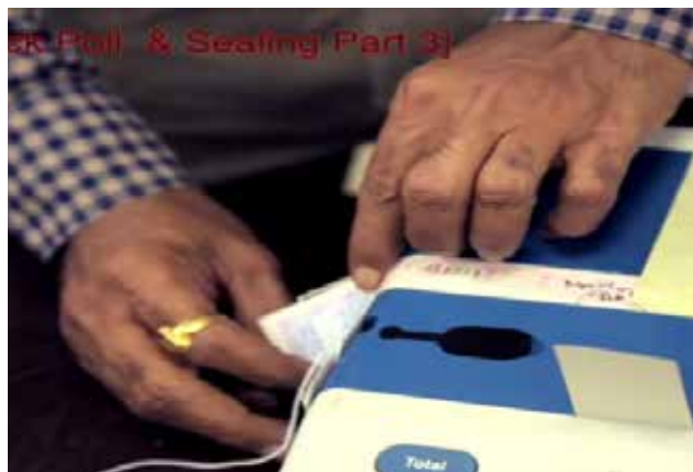
Sealing outer Result Section with Address Tag