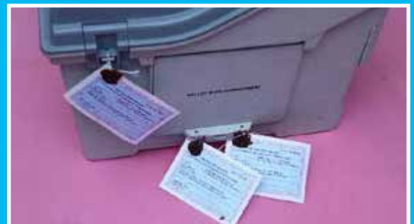
Sealing of Drop Box of VVPAT with Address Tag