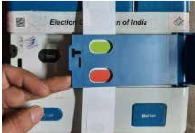
Fixing Green Paper Seal